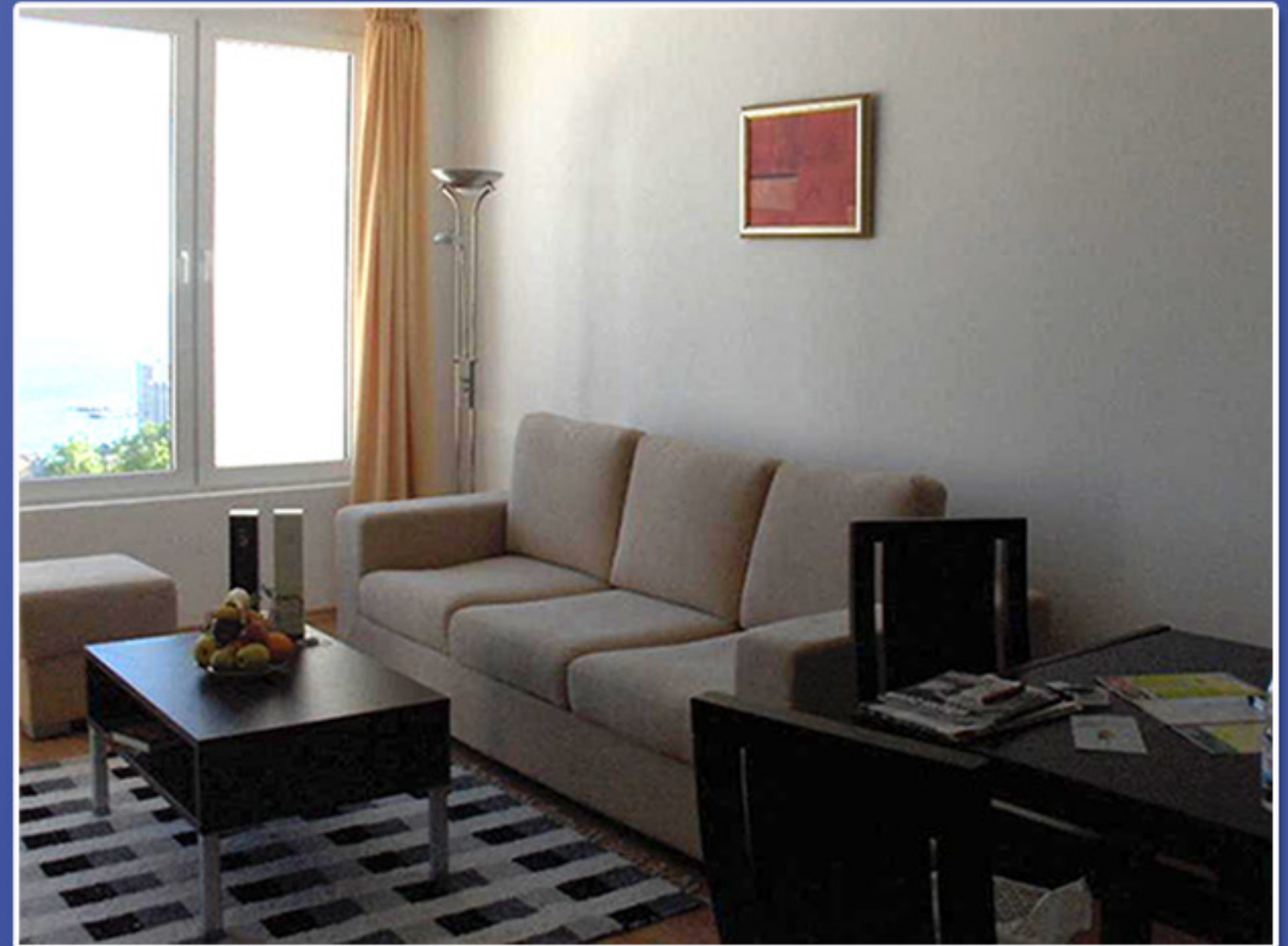
Photos from furnished and unfurnished apartments at GLARUS Residence