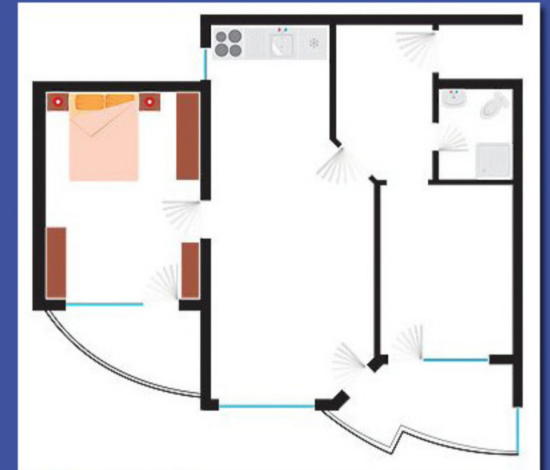
Apartment A44 (4th Floor)