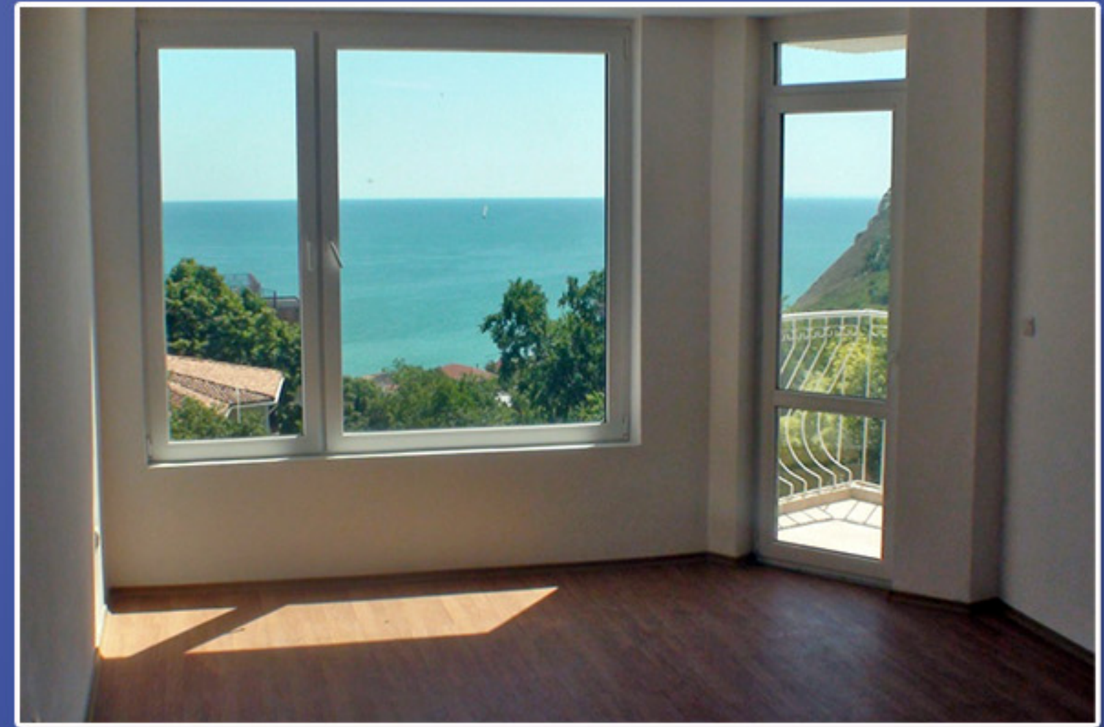
Photos from unfurnished apartments and pool at GLARUS Residence